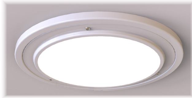
190 Miniature Version

Additional Body Sizes Available In Reflex Recess Range - See Other Product Pages