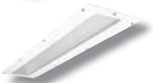
/WFDT Facia Panel Steel White Finish Facia Panel with 6mm Stippled Captive Polycarbonate or GRP Panel