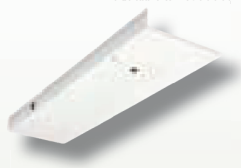
/WFDT Trunking Cover White Finish Steel 3 Compartment Trunking Cover