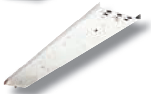
/WFDT Gear Tray ( please specify lamp wattage ) White Finish T5 Fluorescent Gear Tray/ Reflector