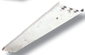
/RYDT Gear Tray ( please specify lamp wattage ) White Finish T5 Fluorescent Gear Tray/ Reflector