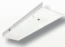
/RYDT Trunking Cover White Finish Steel 3 Compartment Trunking Cover