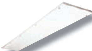
/RYDT Blank Panel Steel White Finish Blanking Plates