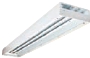
/RYDT Body 2000mm Steel Trunking Section Steel White Finish (Other Colours On Request)