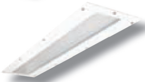
/RYDT Facia Panel Steel White Finish Facia Panel with 6mm Stippled Captive Polycarbonate or GRP Panel